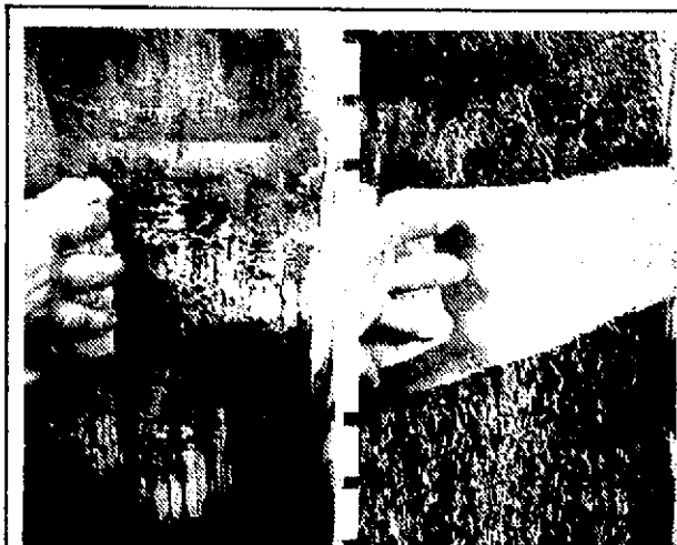
The high temperature brand after 30 minutes. Leaves soil after 6 wipes.