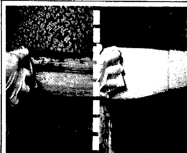
The overnight brand after 6 hours. Leaves grease after 3 wipes.